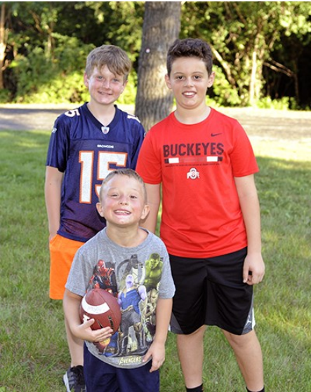
CORN ROAST 2018 Future Masons of B'Ham #44

BIRMINGHAM LODGE NO. 44 F&AM 37357 WOODWARD AVE BLOOMFIELD HILLS, MI 48304-5003