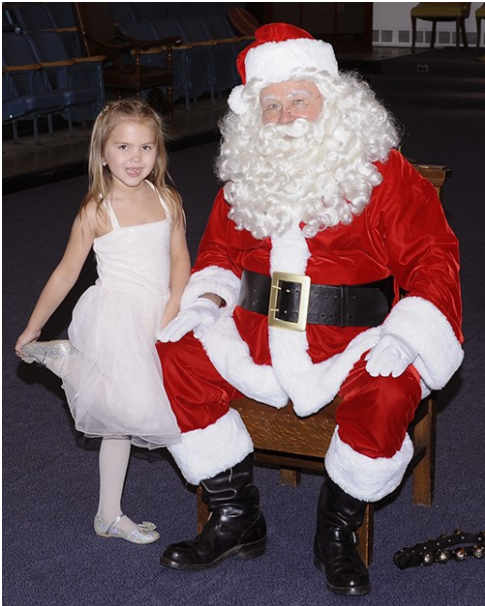
SANTA AND A CUTE BALLERINA AT THE ANNUAL KIDS CHRISTMAS PARTY THIS YEAR.

BIRMINGHAM LODGE NO. 44 F&AM 37357 WOODWARD AVE BLOOMFIELD HILLS, MI 48304-5003