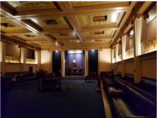
Greek Ionic Lodge Room