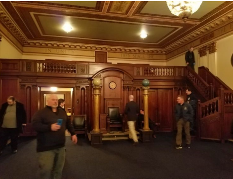
Corinthian Lodge Room