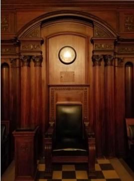
Corinthian Room SW Chair