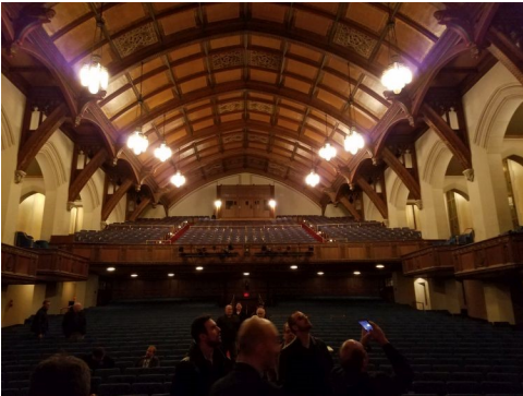
Jack White Theater