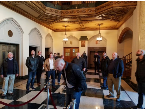
Admiring the lobby architecture