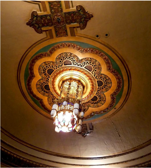
One of the beautiful chandeliers inside the main auditorium at The Masonic.

BIRMINGHAM LODGE NO. 44 F&AM 37357 WOODWARD AVE BLOOMFIELD HILLS, MI 48304-5003